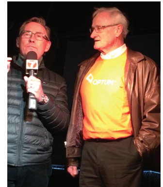
Live broadcast at the Boise Tree Lighting Celebration for 7Cares Idaho Shares